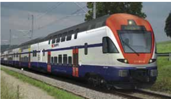
DOSTO Electric double deck train with inter-vehicle systems from HUBER+SUHNER