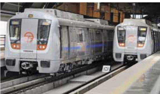
MOVIA Metro Delhi carriage cable assemblies, inter-vehicle systems, e-cabinets