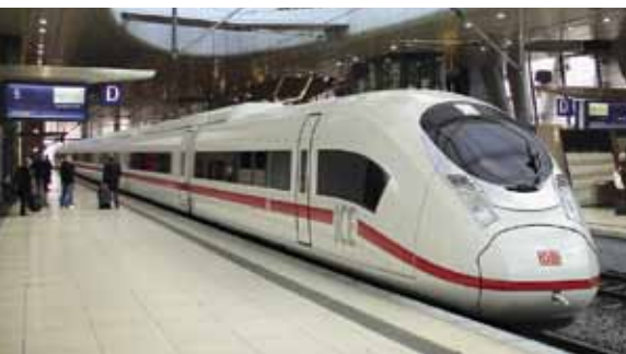
VELARO D inter-vehicle systems designed and developed by HUBER+SUHNER. Inter-vehicle systems suspended under carriage coupling